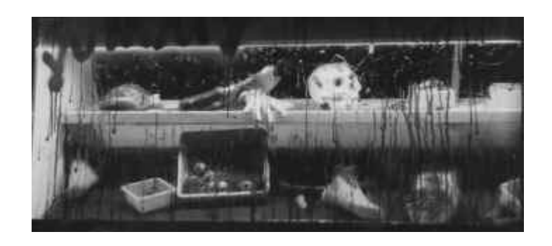
Meat Case In Haunted House