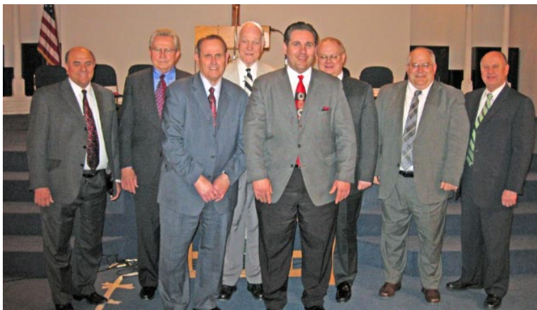
Pictures from the Regional DBS Meeting hosted by Midwestern Baptist College

"What a blessing to our hearts as we watched the services live this evening!!! Thank you all, from the bottom of our hearts, for your stand and defense for our beloved King James Bible. Praying these services will touch many hearts and challenge other believers here in the United States and around the world." (By a husband and wife from ME)